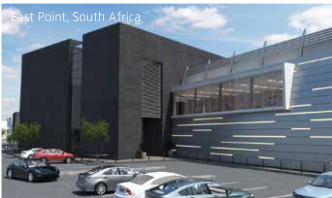
East Point, South Africa

Project Name: Fourways Mall Location: Gauteng GLA (m²): 85,000 (extension and redevelopment) Total GLA to increase to 170,000m² Expected Trading Date: April 2018 Anchor Tenants: Relocating and expanding all major national fashion retailers as well as adding new international brands