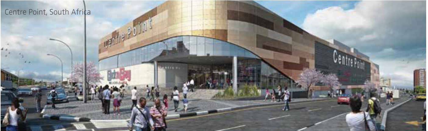
Centre Point, South Africa

Project Name: Mall of Africa Location: Gauteng GLA (m²): 130,000 Expected Trading Date: April 2016 Anchor Tenants: Game, Ster Kinekor, Checkers, Woolworths and Edgars