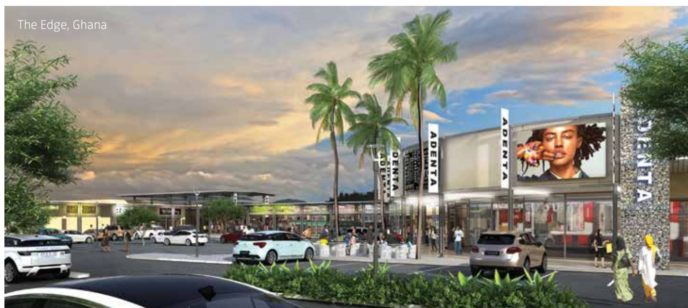
The Edge, Ghana

Project Name: The Edge Location: Accra GLA (m²): 8,000 Expected Trading Date: July 2017 Anchor Tenants: Pick n Pay